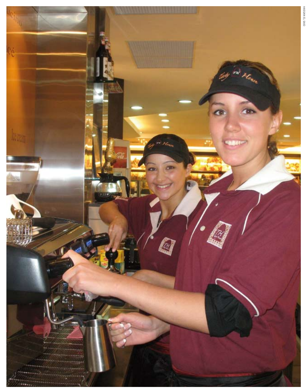
In the shops customers can buy nuts and other sweets over-the-counter but can also have a cup of coffee and a cake. The idea comes from Lebanon.